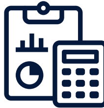
ACCOUNTING & BOOKKEEPING